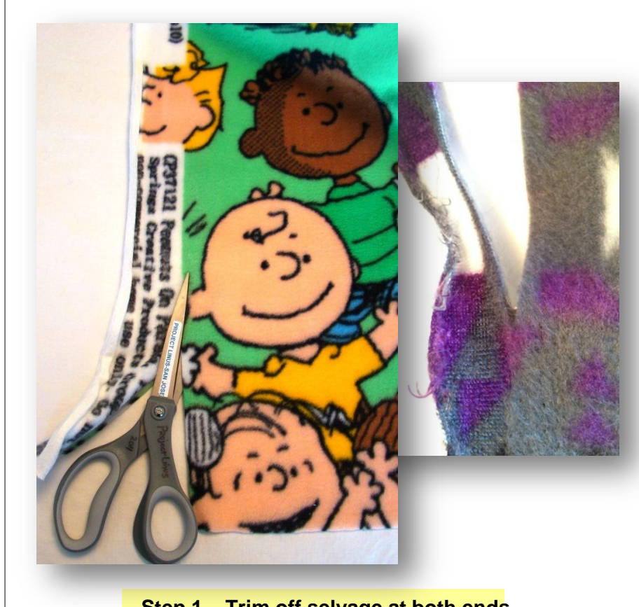
Step 1 – Trim off selvage at both ends. These are the rolled, rough or discolored edges and could be 1/2" – 2"+ wide. Some may even have writing from the fabric maker.