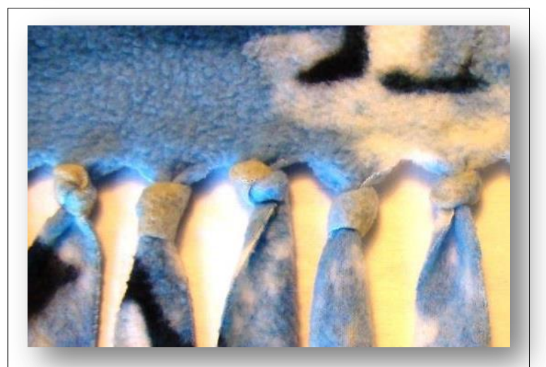
Step 7 – Loosely tie a simple knot at top of each fringe piece so blanket lies flat when finished