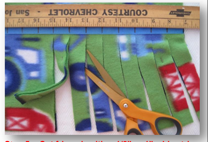
Step 5 - Cut fringe in either 1/2" or 1" wide strips